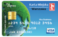
Multicard - Green ID